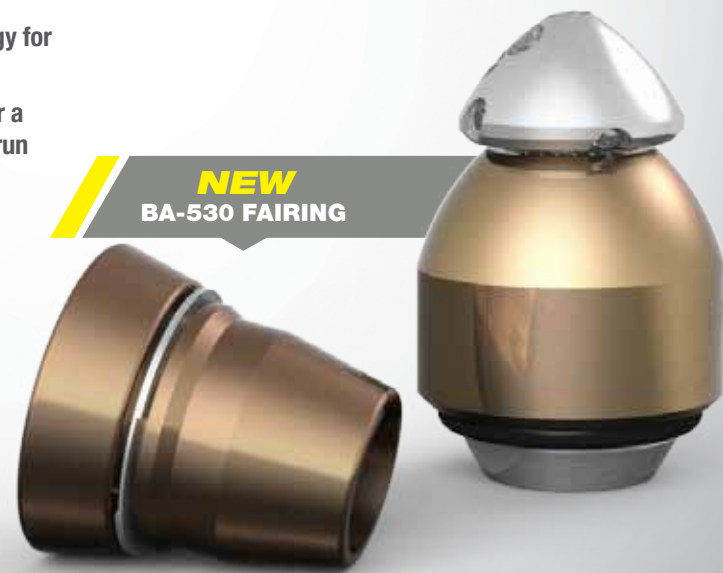
NEW BA-530 FAIRING