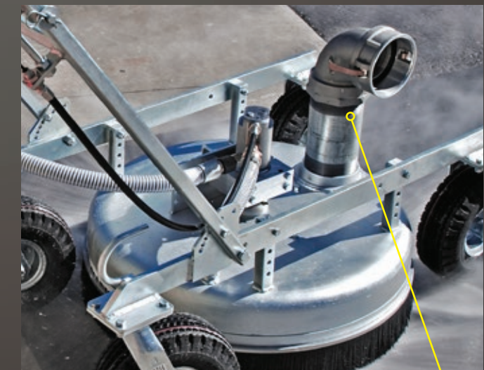
OPTIONAL VACUUM PORT Recovers water and waste material from work area.