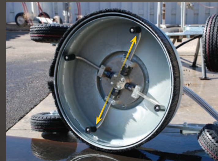
SELF-ROTATING ARMS No additional resources needed to power rotation. Jet paths from 18–24 in. (356–610 mm).