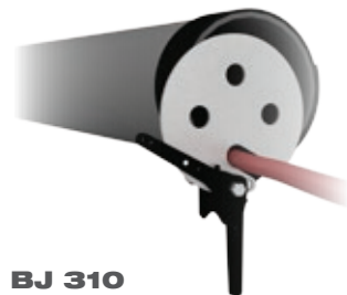
BJ 310 Pipe Sizes 4-8 in. (100-200 mm) For Hose Sizes (ID) 0.32-0.75 in. (8-19 mm)