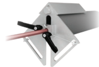
BJ 305 Pipe Sizes 2-6 in. (51-150 mm) Hose Sizes (ID) 0.12-0.32 in. (3-8 mm)

Backout preventers increase safety by keeping the tool from backing out of the pipe. Several options are available including fixtures for small diameter pipes, pipes with various flange bolt circle diameters, and adapters for pipes with no-flange entry.