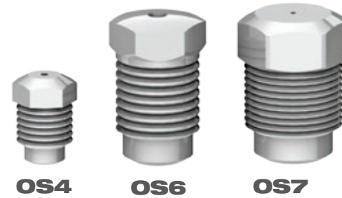
Shown larger than actual size.